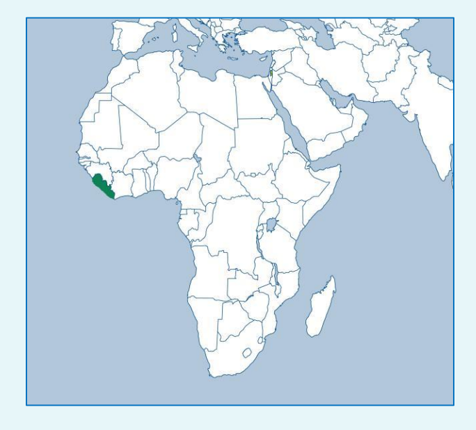
Map of Sierra Leone, Irish Aid, 2015

1 (The World Bank, 2015) 2 (The World Bank, 2015) 3 (UNDP, 2015) 4 (GAIN, 2013) 5 (Kreft, 2015)